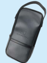
9094 (Carrying Case)