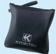
9029 (Carrying Case)